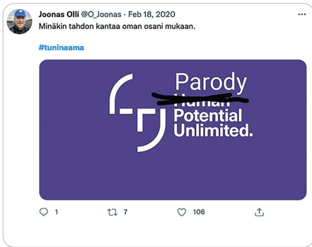
Figure 4: Tuninaama variation where the “Human potential unlimited” slogan is modified

According to Wiggins (2019), memes are used for constructing identities and raising self-esteem, but they also help bring marginal issues to broader attention, which also happened in the Tampere University case. Overall, while the main point of the visual variations was satire and parody, many of the tweets shared a more serious and critical undertone: Twitter users resisted the style and tone of Tampere University communications, which was seen